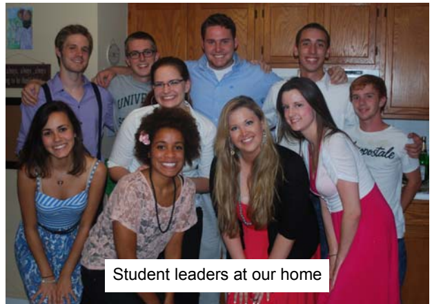
Student leaders at our home