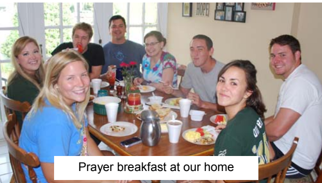
Prayer breakfast at our home

If you have questions about the name change, we'd love to talk to you about it, or you can read about it on the ministry website ( www.ccci.org ).