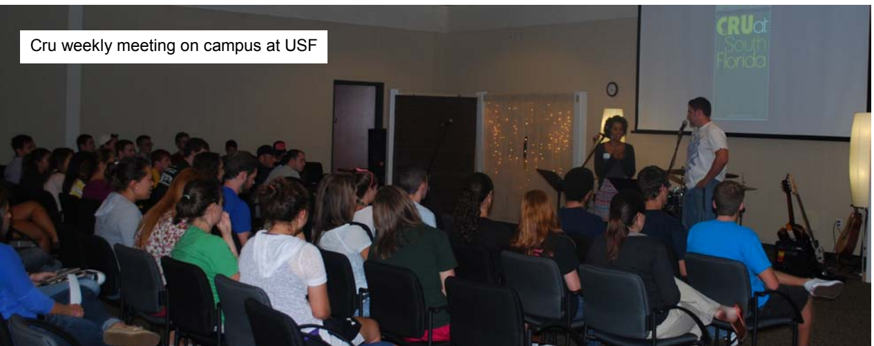
Cru weekly meeting on campus at USF

Also, our Fall Conference is just around the corner. Sept. 30-Oct. 2, Tampa Bay students will be joining students from Orlando and Jacksonville for this great weekend. Will you ask God to 1) get the students there who need to be there; 2) to work in their lives to draw them closer to a relationship with Him or to help them become more confident in sharing Jesus with others; and, 3) to help them connect with each other so they can grow together and encourage each other throughout their college years. You can check out more info on the conference at www.noloudersound.com . Once again, thank you. Your prayers are more valuable than we can say!